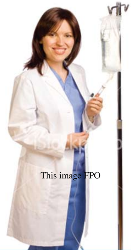
This image FPO